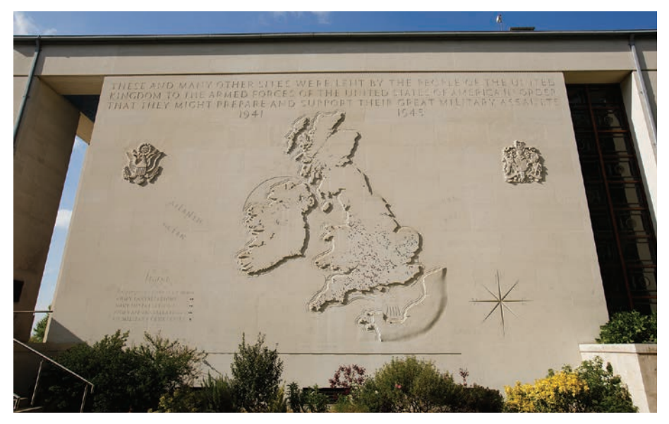
The map displays locations of American units in the United Kingdom during World War II.