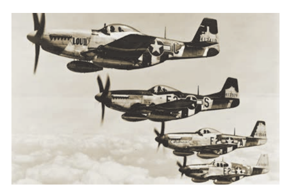
North American P-51 Mustangs of the 361st Fighter Group fly in formation over England in 1944.

Advances in the Mediterranean opened up airfields complementing those in Great Britain, permitting shuttling