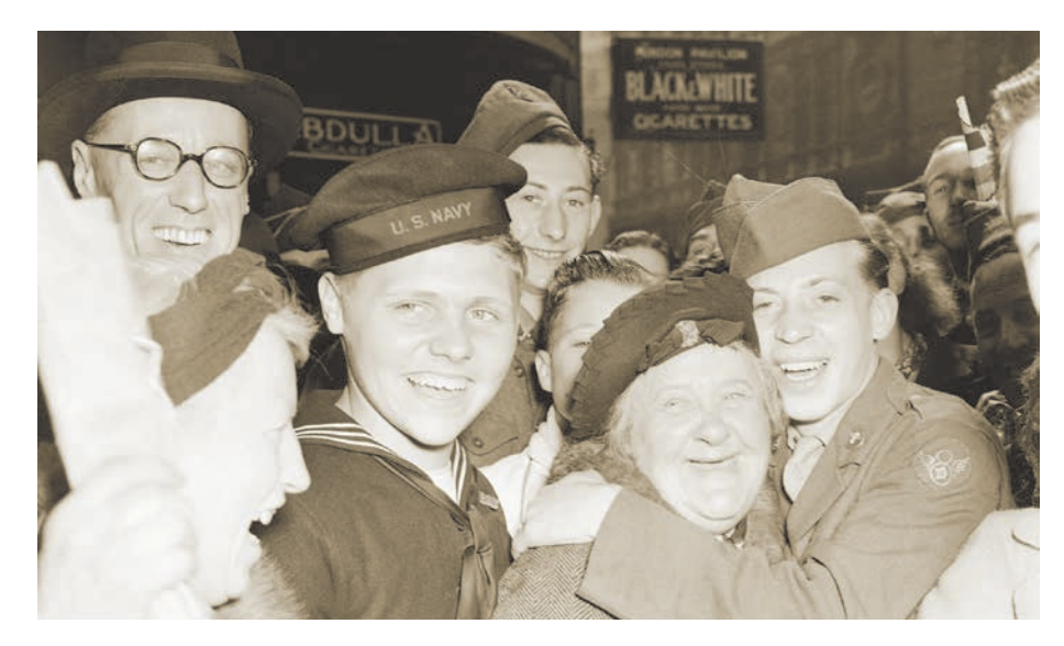
American servicemen and British civilians in London celebrate Germany's surrender. May 8, 1945.

Cambridge American Cemetery honors more than 8,500 Americans who died in operations based out of the United Kingdom. These include those who battled to secure the Atlantic, those who fought in the skies over Europe, and those who prepared for and participated in the invasion through Normandy and the campaigns that followed.