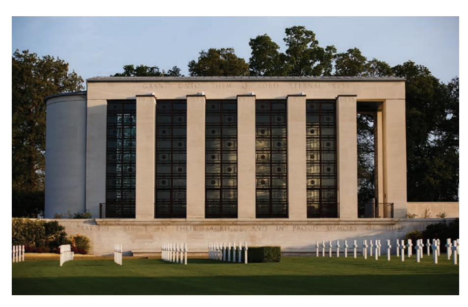
The north face of the memorial building.