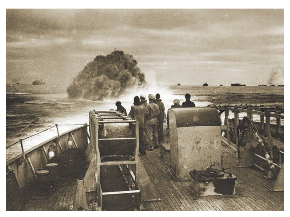
Coast Guardsmen of the U.S. Coast Guard Cutter Spencer watch the explosion of a depth charge blasting German submarine U 175 about to attack a convoy in the North Atlantic. April 17, 1943.

Through 1942 the balance poised precariously, with the Allies losing 800,000 tons