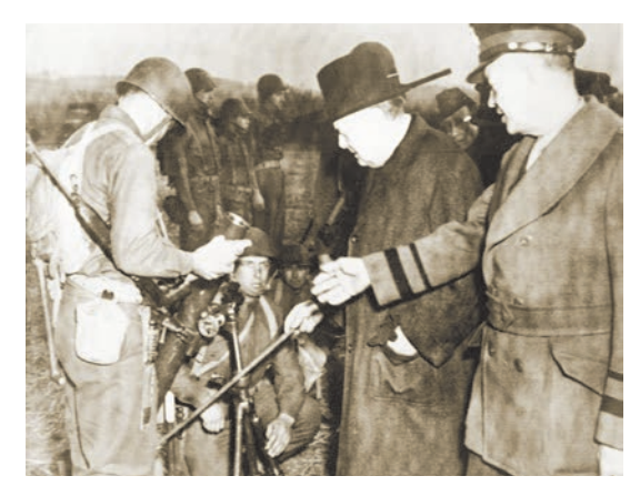
Prime Minister Winston Churchill and General Dwight D. Eisenhower inspect a mortar crew during a tour of an American Army base in England before D-Day, 1944.

American forces that had been building in England since midto-late 1942 were committed into Operation TORCH, American task forces landed on beaches flanking Casablanca, Morocco. Combined Anglo-American