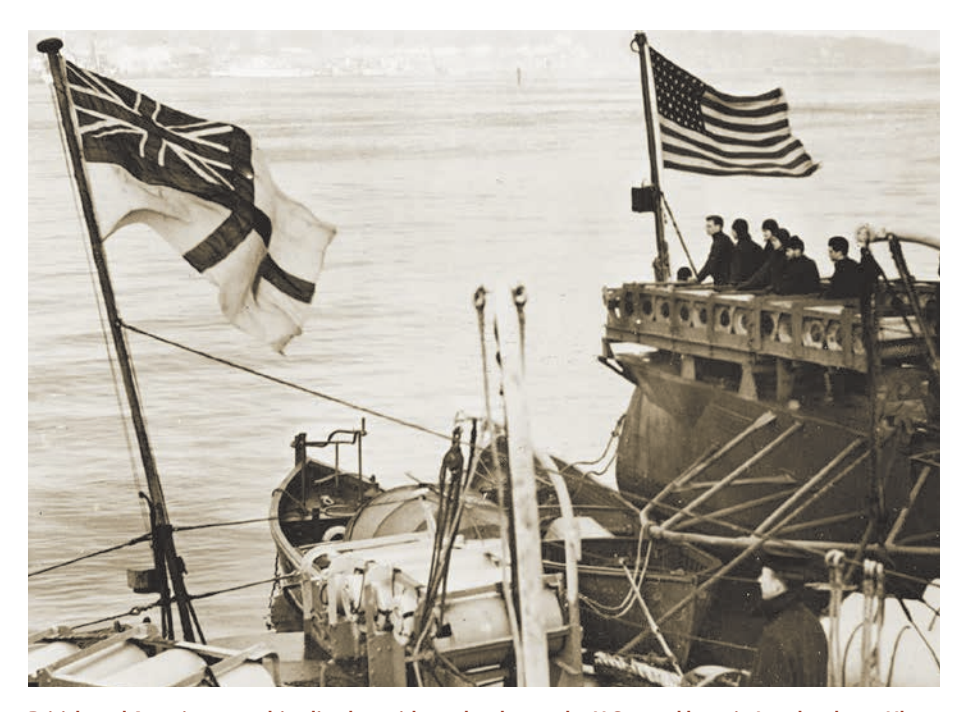
British and American warships lie alongside each other at the U.S. naval base in Londonderry, Ulster. The American warships had escorted a convoy across the Atlantic, and arrived at Londonderry in January 1942.

of shipping more than they replaced with new construction that year. In May 1943 the balance finally tipped decisively in favor of the Allies. In that month, increasingly effective Allied forces sank 41 of 240 German U-Boats, while losing fewer than 300,000 tons of shipping to them.