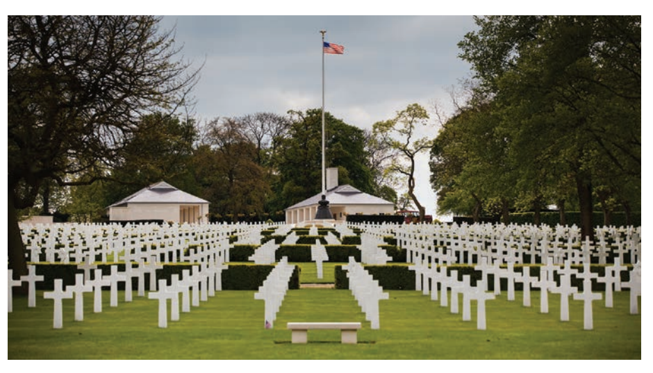
In the Cambridge American Cemetery the headstones are aligned like the spokes of a wheel.

I SHALL MAKE IT CLEAR AT THIS MOMENT THAT WE NEVER FAILED TO RECOGNIZE THE IMMENSE SUPERIORITY OF THE POWER USED BY THE UNITED STATES IN THE RESCUE OF FRANCE AND THE DEFEAT OF GERMANY.