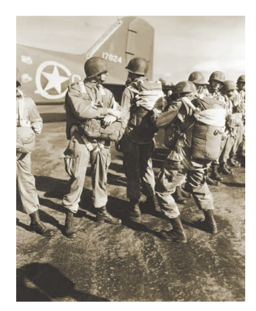
U.S. Army paratroopers of the 2nd Battalion, 503rd Parachute Infantry, inspect equipment before a training jump in England, 1942.

task forces similarly attacked Oran and Algiers, Algeria. Near Casablanca and Oran, resistance was significant at first, but force and diplomacy induced the Vichy French to surrender. In Algiers, a pro-Allied uprising enabled the landing force to take the city with minimal conflict.