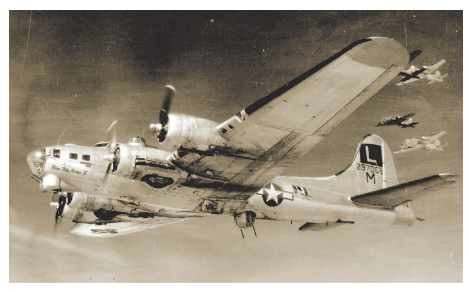
The B-17G Flying Fortress "Mon Tete Rouge II," and other bombers of the 452nd Bomb Group, flying on a mission to bomb German targets in France on March 28, 1944.