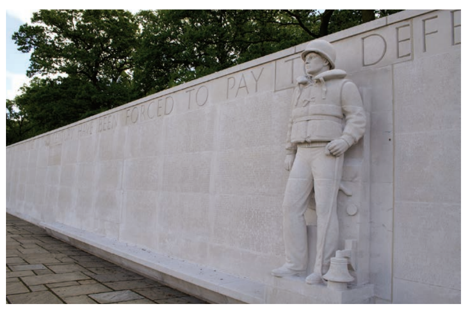
The statue of a Coast Guardsman is one of four standing watch over the Wall of the Missing.