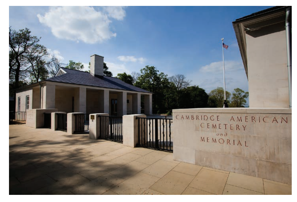
The entrance welcomes visitors to Cambridge American Cemetery.

The cemetery is situated on the north slope of a hill from which Ely Cathedral, 14 miles in the distance, can be seen on a clear day. It is framed by woodland on the west and south. The road to Madingley runs along the cemetery's northern border.