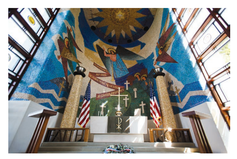
The deep blue of the ceiling above the altar denotes the depth of infinity.